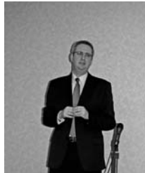
Cover shows Ivan Lewis MP at the Valuing People Consultation.